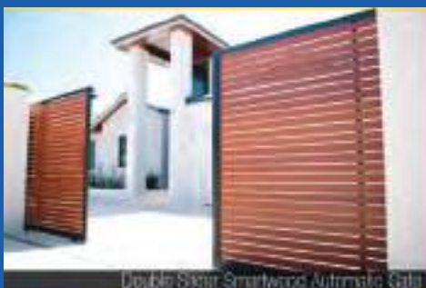
Double Sider Smartwood Automatic Gate

Below is a guide to some of the different gates we have available. However, you may choose from any of the fencing styles or make your own custom design.