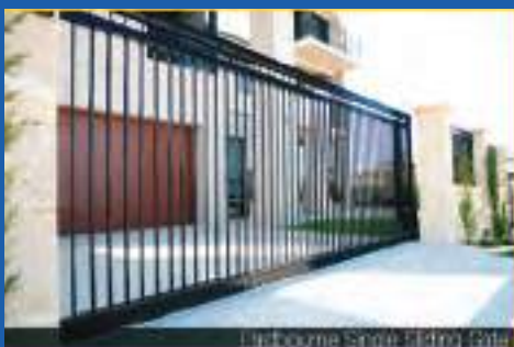
Linbourne Single Sliding Gate